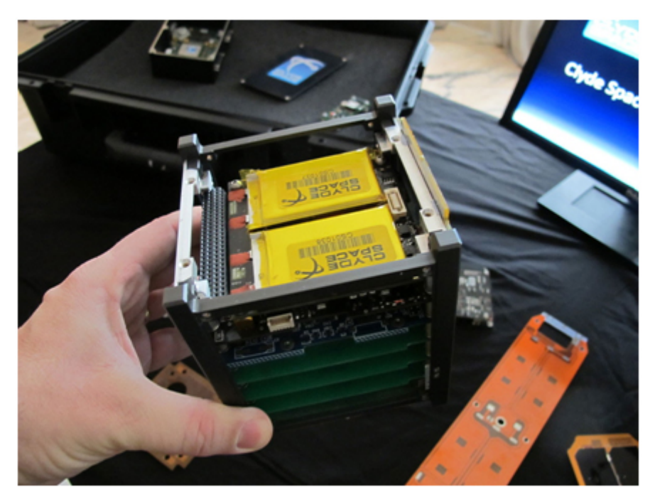
Image 1. 1U cubesat structure without outer skin

have been launched by universities and schools.[3] However, the CubeSAT platform's low cost to build, low-weight (meaning low cost to lift), and standardized frame make CubeSATs accessible platforms for nascent space programs.